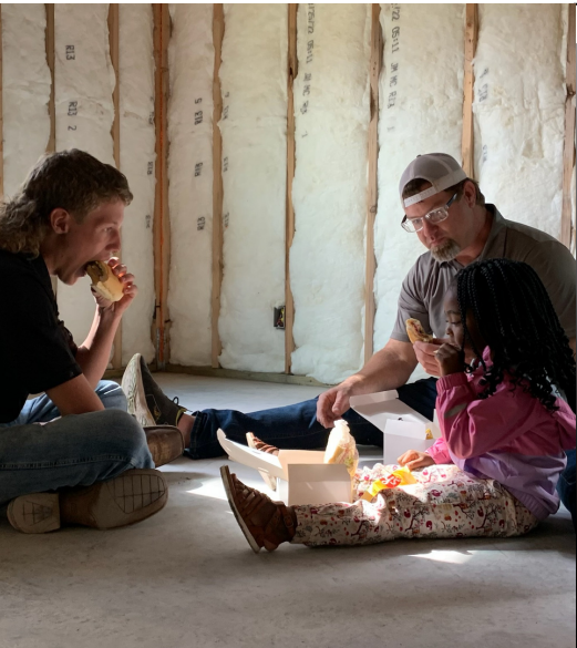
IMPACT REPORT 2022-2023

We are committed to honesty and transparency. We aim to do what's right, even when no one is looking. That's what being "trustworthy" means to us. Whether it's seen in our actions, our words, or our financial information, we aim to illustrate our commitment to trustworthiness in everything we do.